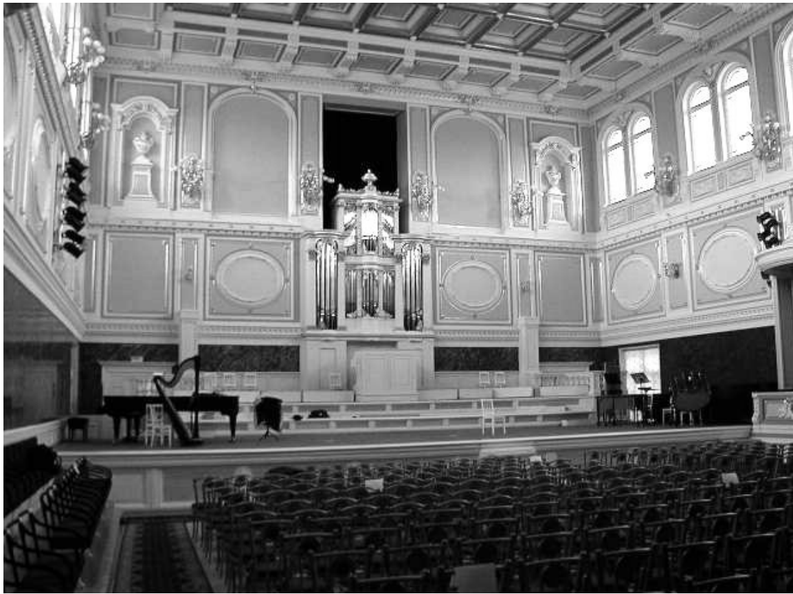
St. Petersburg, The State Academic Capella Concert Hall (Instrument by E. F. Walcker)